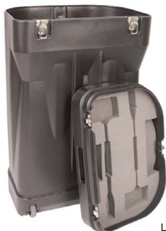
Lid with internal foam insert for lighting storage